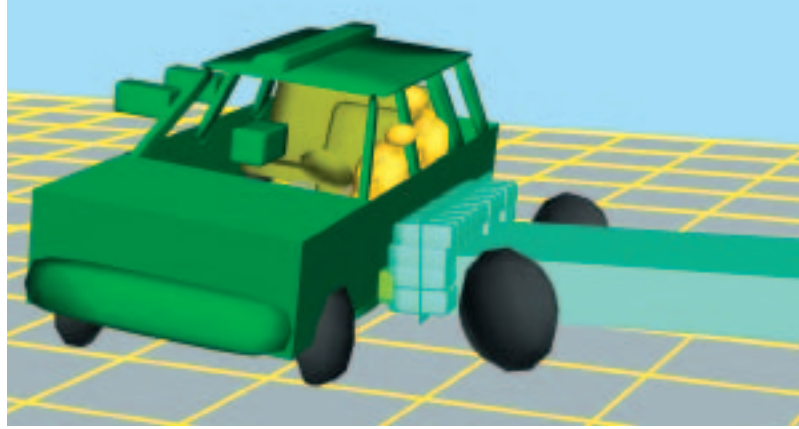
Side Impact Test Simulation