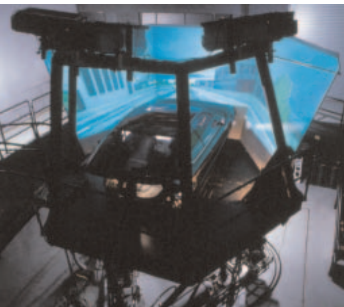
DRI Moving Base Driving Simulator

Overall, these software capabilities fully complement DRI's computing hardware resources, and enable an applied research group the size of DRI to accomplish very significant experiments, analyses, simulations, and hardware and software development, to support the needs of our clients.