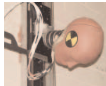
Twin Rail Drop Impactor