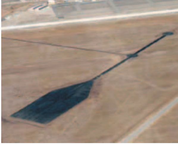
DRI Vehicle Dynamic Area Test Facility