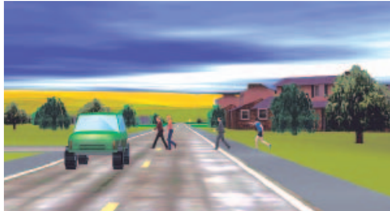
Driving Simulator Roadway Scene

DRI has a regular staff of 35 engineers, scientists, technicians, and support personnel, many of whom hold advanced degrees.