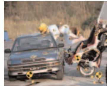
ISO MATD Dummy in Crash Test