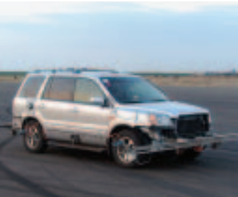
Full Scale SUV Rollover Resistance Test with AVC