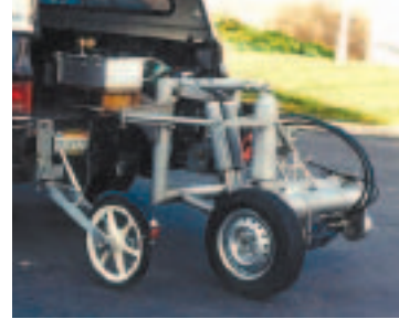
Mobile Tire Tester